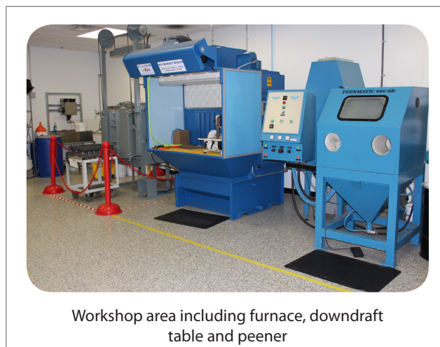
Workshop area including furnace, downdraft table and peener

The workshop area where parts are removed from plates and post-processed can require a significant amount of space on its own. The workshop at the SLM Solutions' facility in Wixom, Michigan is about one-half the size of the additive manufacturing room. The workshop contains a bandsaw, machining center, heat treating oven and two shot peeners that support four additive manufacturing machines. A company running high volume production and doing a considerable amount of post-processing work might require even more workshop capacity for the same number of additive manufacturing machines.