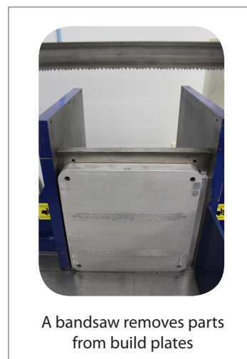
A bandsaw removes parts from build plates

Post-processing equipment is necessary to remove parts from build plates, resurface those plates for reuse, perform heat treatment and inspect parts. A bandsaw or electrical discharge machine (EDM) is used to remove parts from the build plate. Build plates can be finished with a small machining center, milling machine or grinder. Another option is to outsource the task to a local machine shop, but this option requires a larger plate inventory.